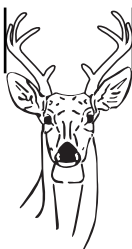
12" Inside Spread